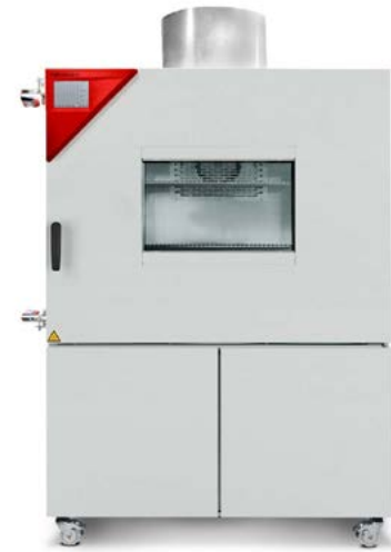
Model MK 240 with package P