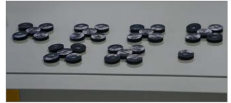
Access ports for cables and power cables.

Precise positioning in almost all sizes and locations is possible in consultation with our BINDER INDIVIDUAL department. Access ports available in silicone or stainless steel.